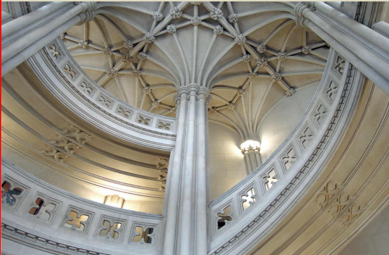
Photograph by: Roy Weinstein, 2011